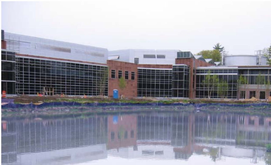
Eisai Research Institute of Boston

Enlargement of the capacity in the U.S. and Europe