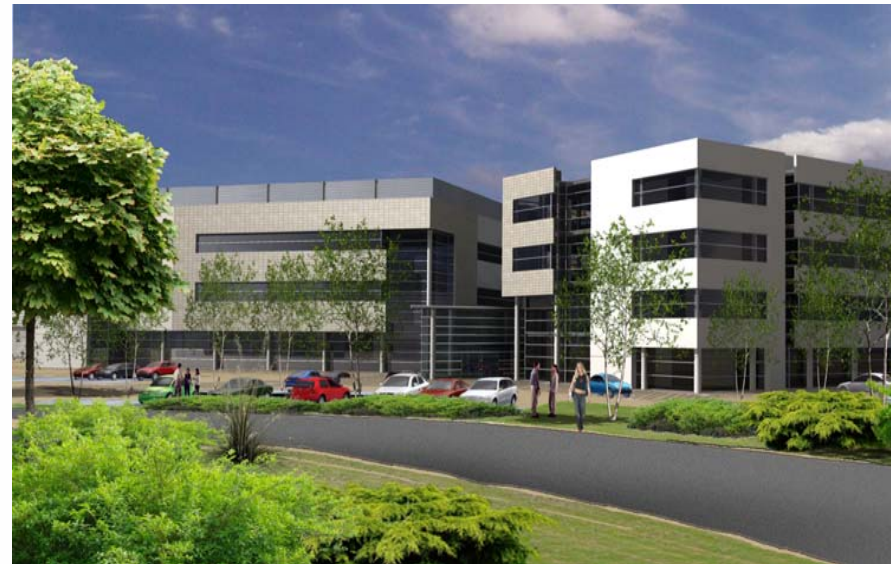
European Knowledge Center (Image)